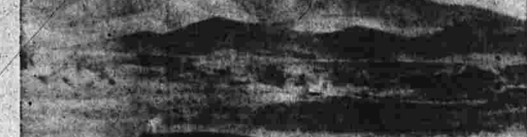
Donald Campbell, British sportsman, roars his jet-propelled Bluebird II at 218.2 miles per hour over a measured (kilometer) course on Lake Mead, near Las Vegas, Nov. 18. He took a terrific beating because of high winds.